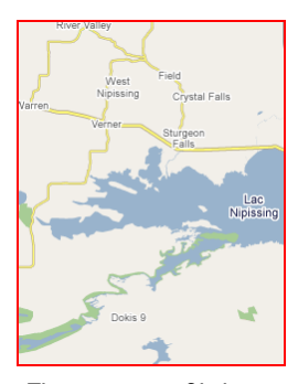
The west arm of Lake Nipissing. Contact Doug Hay to reserve your spot.