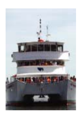
Chief Commanda II at Sail on Lake Nipissing